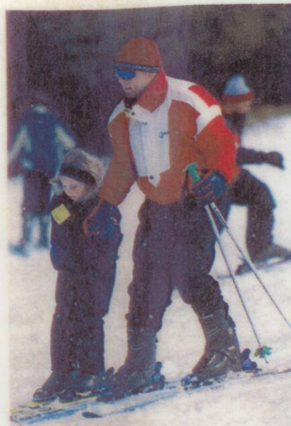
Cataloochee offers programs for kids, especially first-time skiers.

Speaking of kids, one of the special offers during this season is Cataloochee's Kids Ski and Stay Free Program