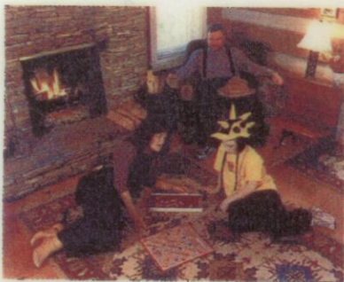
Each of the Boyd Mountain cabins was built from structures found in surrounding counties.

Cataloochee Ski Area: 1080 Ski Lodge Road, Maggie Valley, NC 28751; 1-800-768-0285 or www.cataloochee.com . Boyd Mountain Log Cabins: 445 Boyd Farm Road, Waynesville, NC 28785; (828) 926-1575 or www.boydmountain.com . Rates: $140-$275. Another lodging option: Cataloochee Ranch, next door to the ski area, has a lodge and cabins on-site (they do not participate in the Kids Ski and Stay Free Program); 1-800-868-1401 or www.cataloochee-ranch.com . Rates: $79-$129, lodge; $129-$159, cabins. ♦